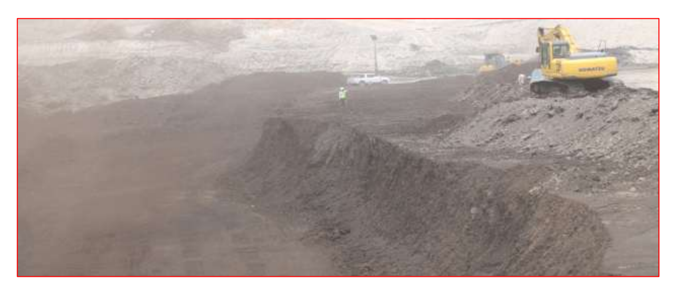
SEM Coal Mine: Pit 3 Thick coal seam