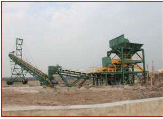
New crusher at jetty (under construction)