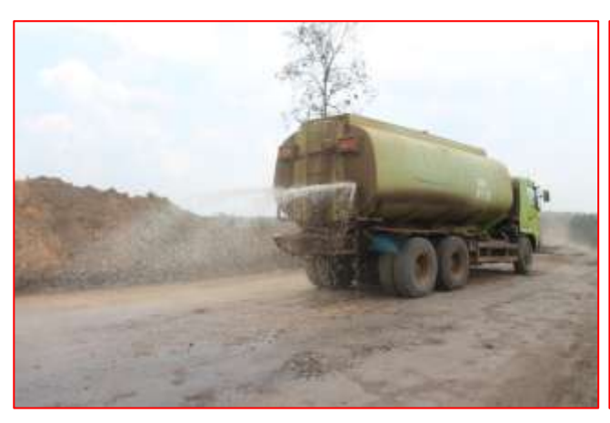
{\it Regular \, road \, maintenance \, and \, widening}

For the Ex-Pertamina road (please refer to "Major Events" for details) the Company has recently commenced various upgrades and is planning to conduct feasibility studies on the construction of an all-weather tar road to further improve transportation efficiency.